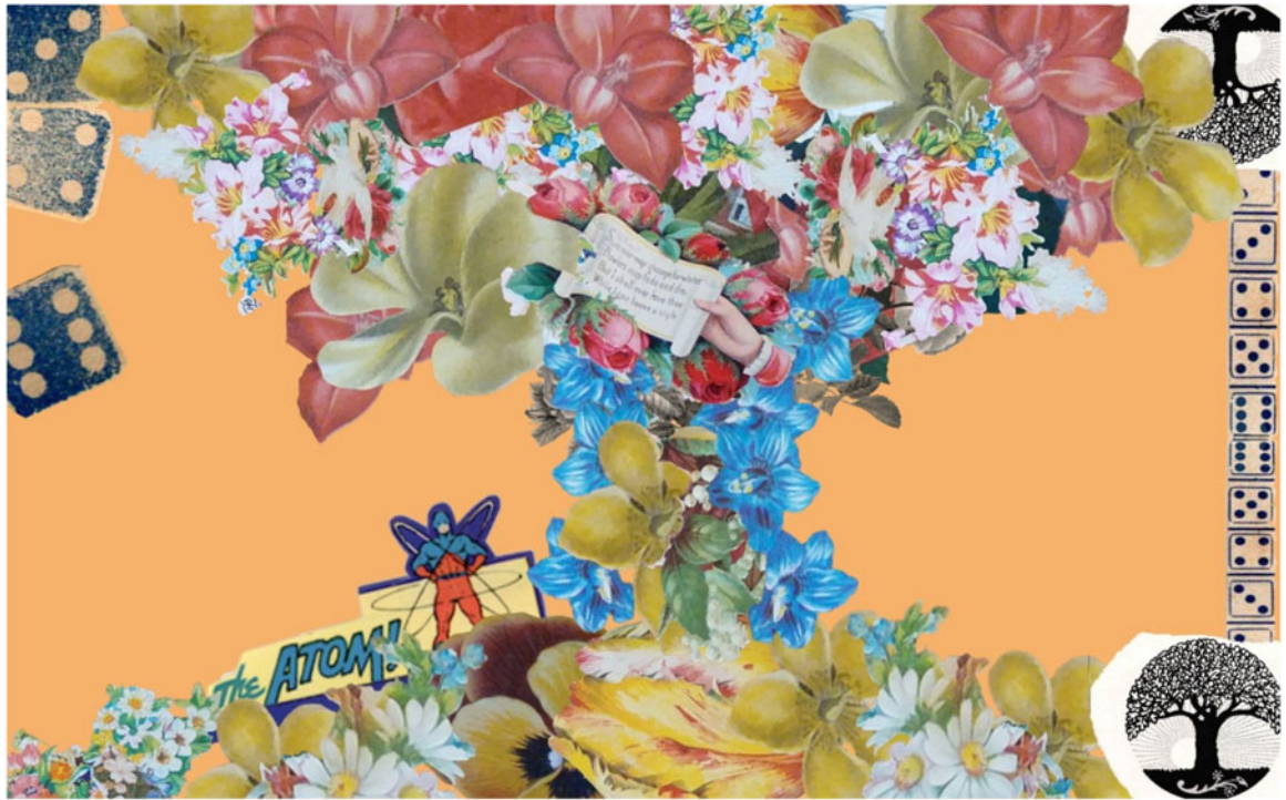
Fig. 2 The Spectacular Possibility of Living a Half Life , by ‘Helix’. © ‘Helix’ and Rona Cran

affective and informally creative nature of their responses to the collage composer and to the fragments themselves. Examples of feedback received from participants include (italics are mine):